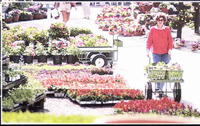
Florists and Greenhouses in the field.