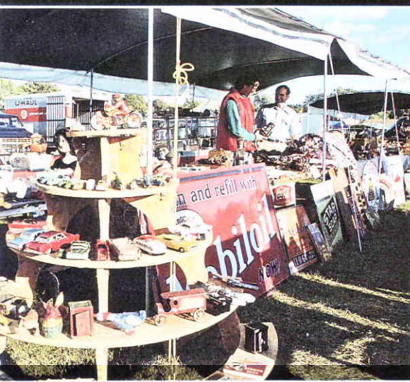
Flea Markets and Fairs under a tent.