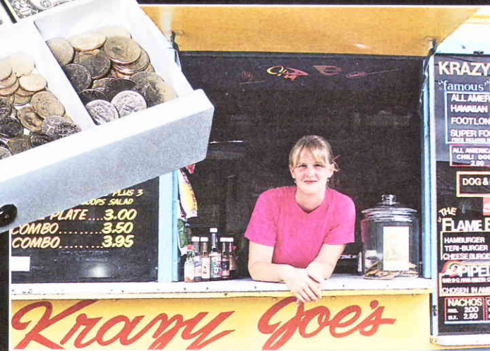
Snack Trucks on the road.